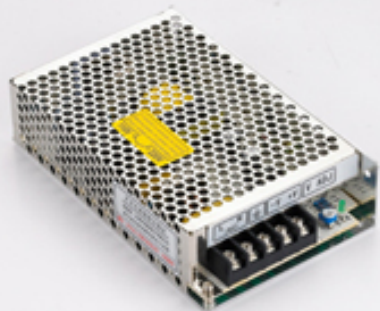
CASE: P15-4 159×98×38mm